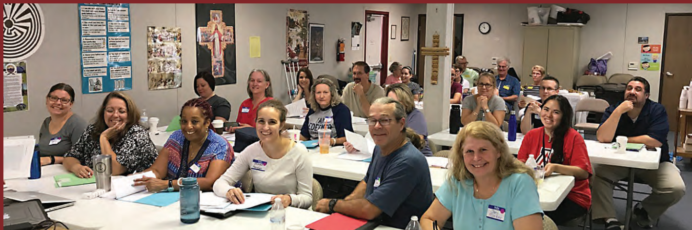
Teachers in the St. Clare room at the Mission enjoying a break during an intense morning of study.

This summer, 19 teachers from Tucson Unified District participated in a continuing education class with docent trainers to prepare for visits during the school year. This program will expand to other school districts and to private school networks in the coming months. For more information visit our website: Patronatosanxavier.org