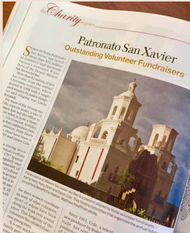
The Tucson Lifestyle story about our volunteers in the November issue.