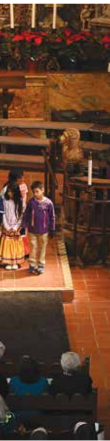
Children perform at the