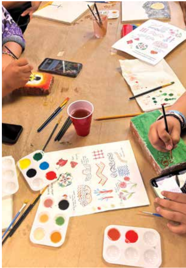
San Xavier District Summer Youth Employment Program 2025, plaster painting workshop at San Xavier Mission