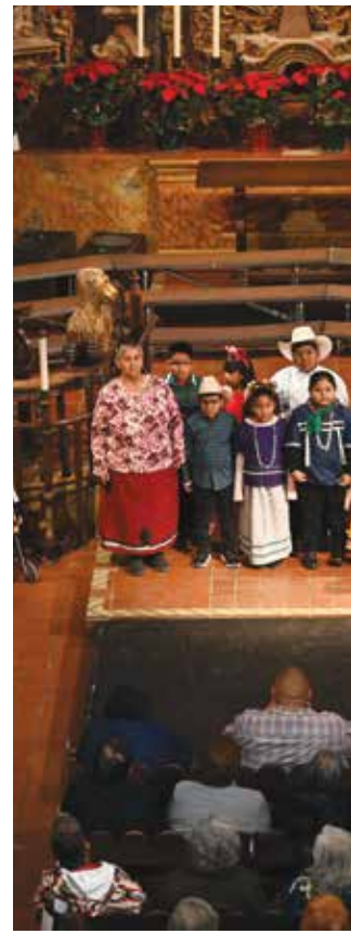
Children from the Mission School perform during a concert for the Wa:k community.

Building and sustaining these relationships is fundamental to our work. The O'dham people have safeguarded the Mission across generations, and Patronato is committed to approaching preservation with respect for this living history.