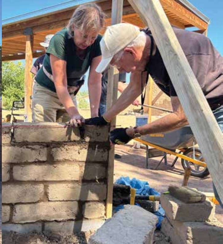
TICRAT 2024, Mud Plastering (left), Adobe wall building (right), Hubble Gutierrez House