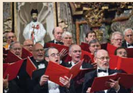
The Christmas Concerts at San Xavier