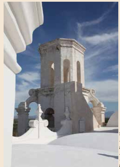
Views of San Xavier's East Tower show continuing deterioration

For more information about the project, or to pledge your financial support, please contact Patronato at (520) 407-6130 or visit us at www.patronatosanxavier.org