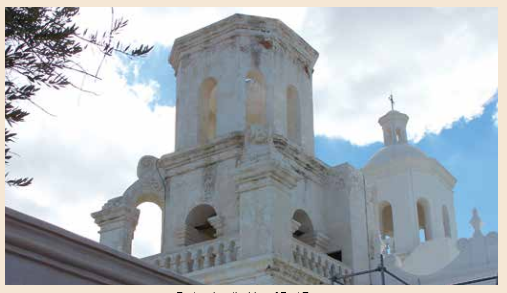
East and north sides of East Tower

exterior, exposing the structure to further damage.